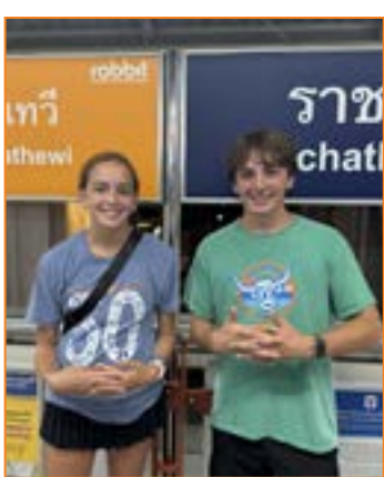
These campers made a trip to Thailand after first term and sported various CLH gear through the whole trip!