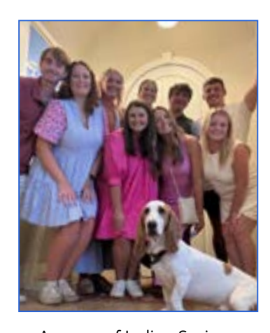
A group of Indian Springs counselors and staff saw each other in Port Aransas to celebrate Labor Day!