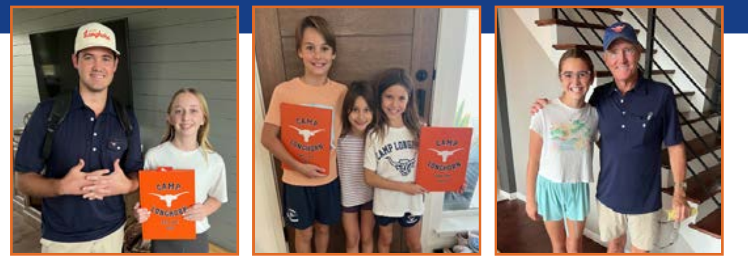
For more 2024 Yearbook Delivery Photos, visit https://camplonghorn.com/r/19